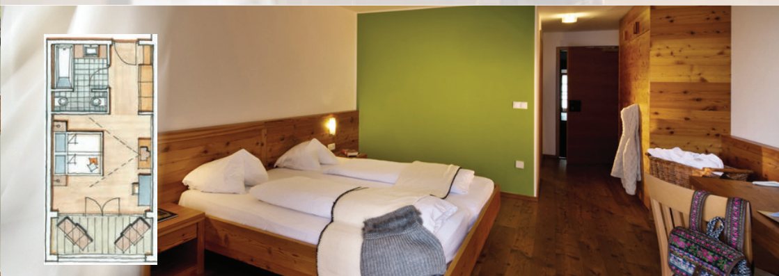
NATURE ROOM SILVA