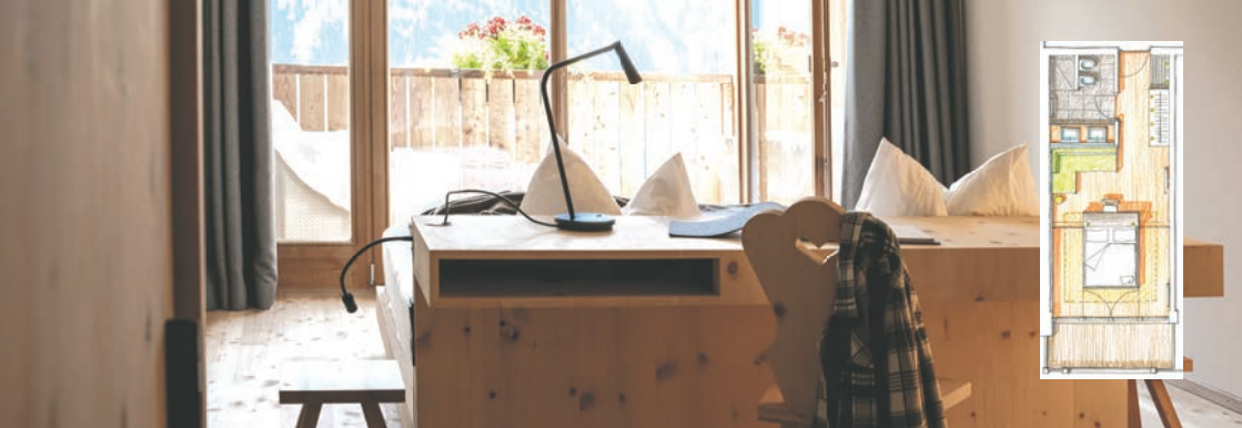
NATURE ROOM ARCANA