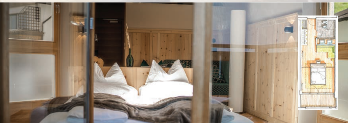
NATURE ROOM MATER